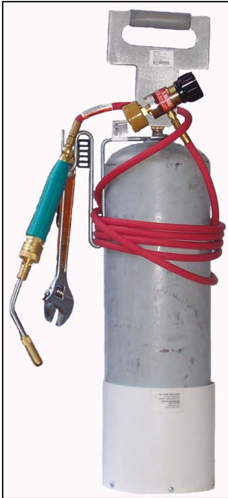
B-TANK HANDLE™ Model # BT

Makes Hand-Carrying B-Tanks Easier and Safer!