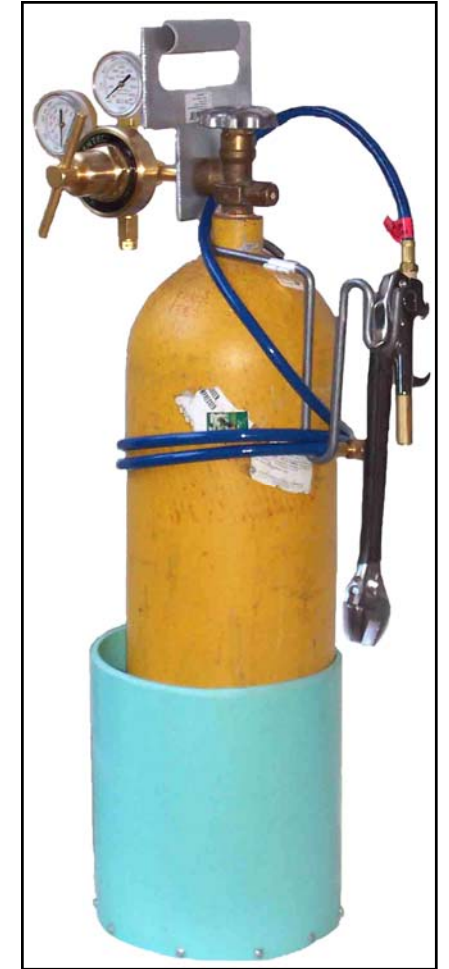
NITRO-TANK HANDLE™ Model # NT

Makes Hand-Carrying Nitro Tanks Easier and Safer!