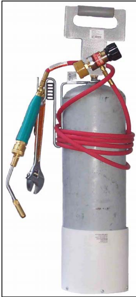
B-TANK HANDLE™ Model # BT

Makes Hand-Carrying B-Tanks Easier and Safer!